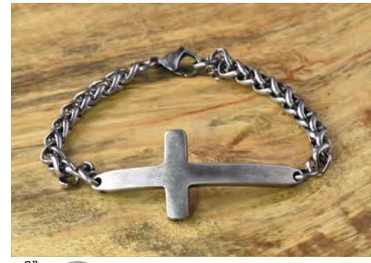
STAINLESS STEEL WHEAT CHAIN ADJUSTABLE CLOSURE